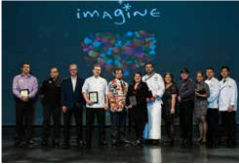
Local Chefs at IMAGINE Gala

Thank you to all of our donors. Every donation and every third party fundraising event brings us that much closer to achieving our goal to provide the Tri-Cities with essential services needed to support the well-being of our community.